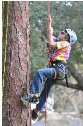
Kids Tree Climb at Windermere Treebute